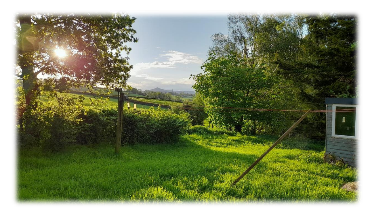
Wonderful views across north Monmouthshire towards Mynydd Pen-y-fâl (The Sugarloaf) from the back garden of the Vicarage