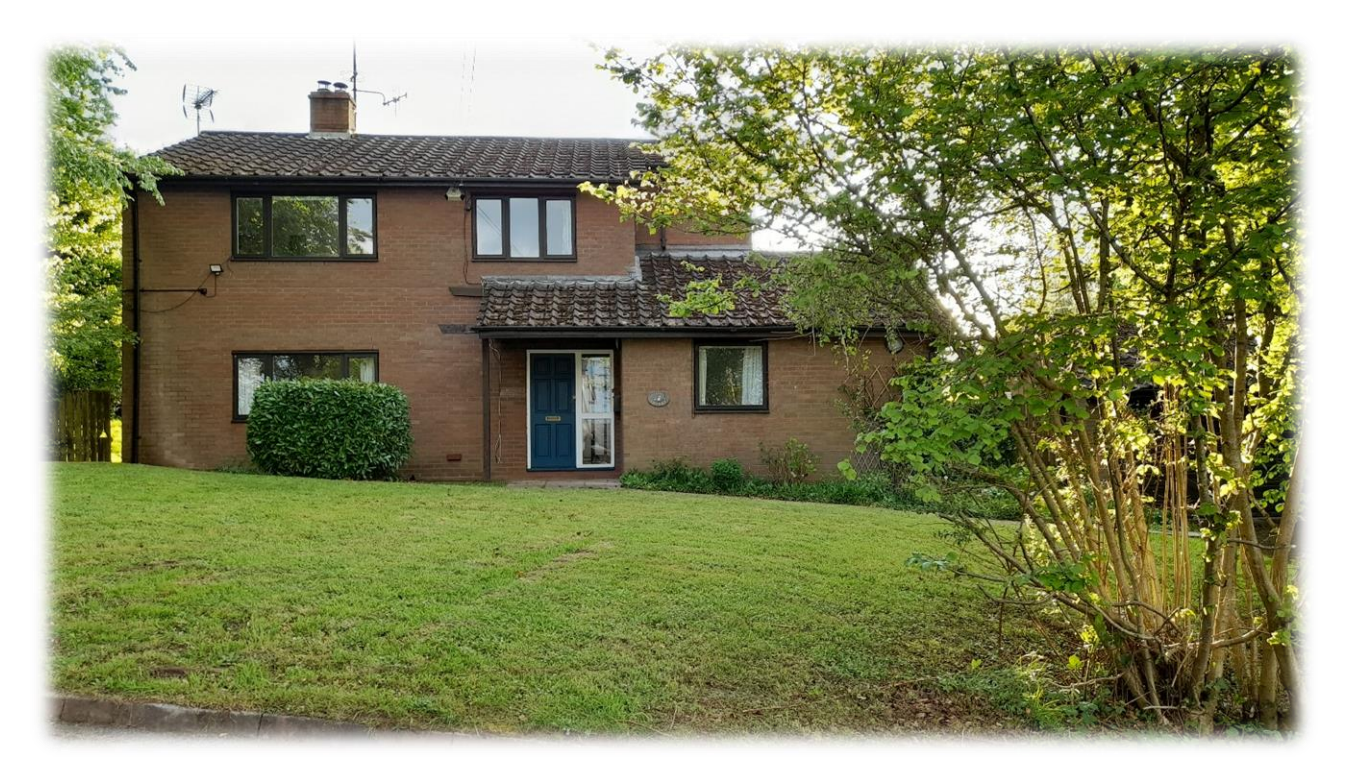
Front view of the Vicarage at Llanddewi Rhydderch

The house is a modern four-bedroom detached property, set in its own garden with a drive and garage. It will afford spacious, private accommodation, offering a comfortable home as well as an office for the appointee. Further details of the locality, the churches, financial information and their congregations appear in the attached Appendix 1. for the Llanddewi Rhydderch Pastoral District.