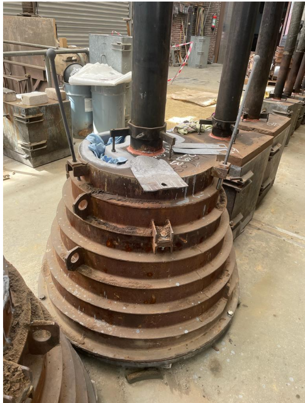
The casting of the bell