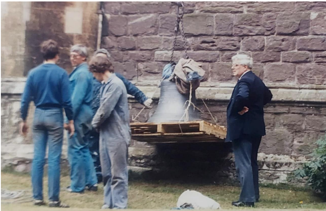
Raising of the flat 6th in 1989

Few events are guaranteed to cause more excitement in a tower than the arrival of a new bell! The last time St Woolos were augmented was 34 years ago in 1989 when the flat 6th was added to give us a light ring of 8 bells at the front.