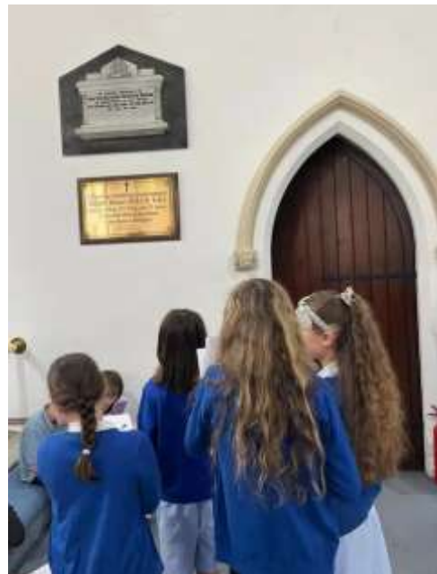
St Mary's Risca and St Margaret's Pontymister loved welcoming in pupils from Ty Sign Primary School. It was fantastic to see them investigating memorials in the church building and in the churchyard. They are expecting more pupils later this week.