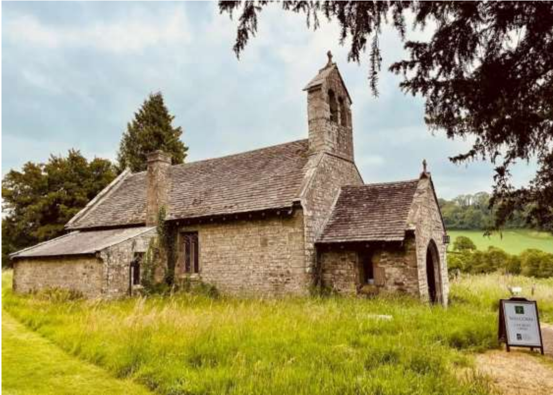
St Aeddau's Church, Bettws Newydd, is a fascinating church in a beautiful location.