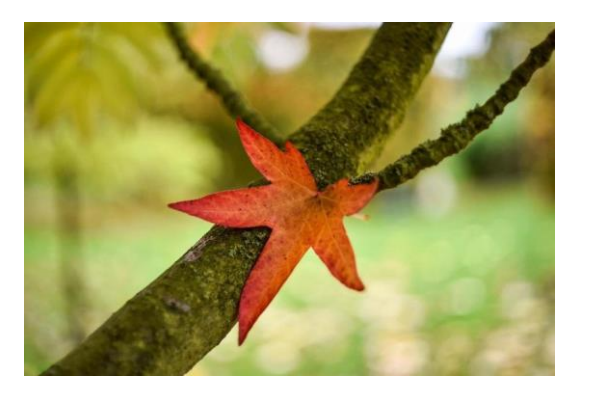
How can we encourage others?

Do you see an inner sense of call in them? Are they content to be in the Church in Wales?